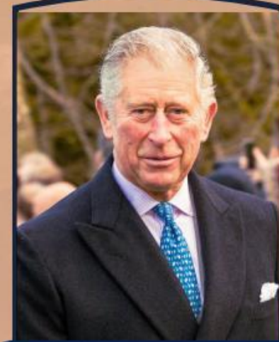
King Charles III