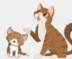
cat and kitten