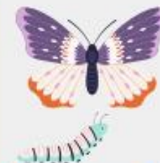
butterfly and caterpillar