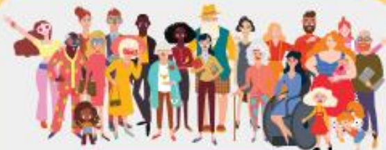
people grow and change