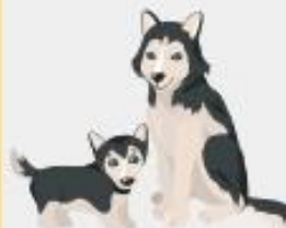
dog and puppy