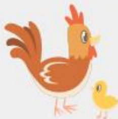
bird and chick