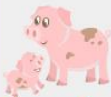
pig and piglet