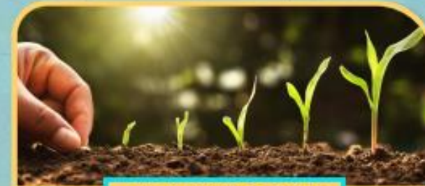
plants grow and change