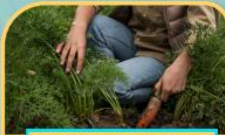
we can grow food to eat