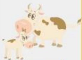
cow and calf